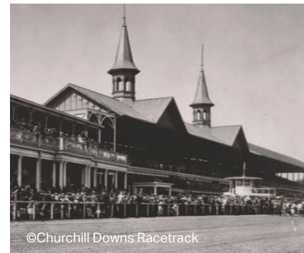
@Churchill Downs Racetrack

Photographs, videos, and artifacts that'll make you go, "Whoa!"