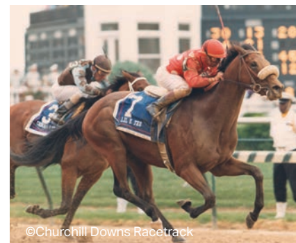
@Churchill Downs Racetrack